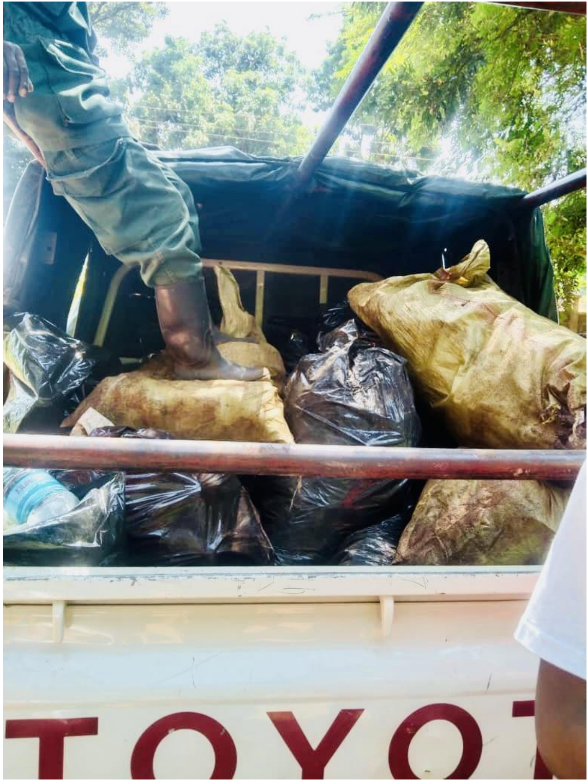
[218.9 kg of plastic and debris were collected]