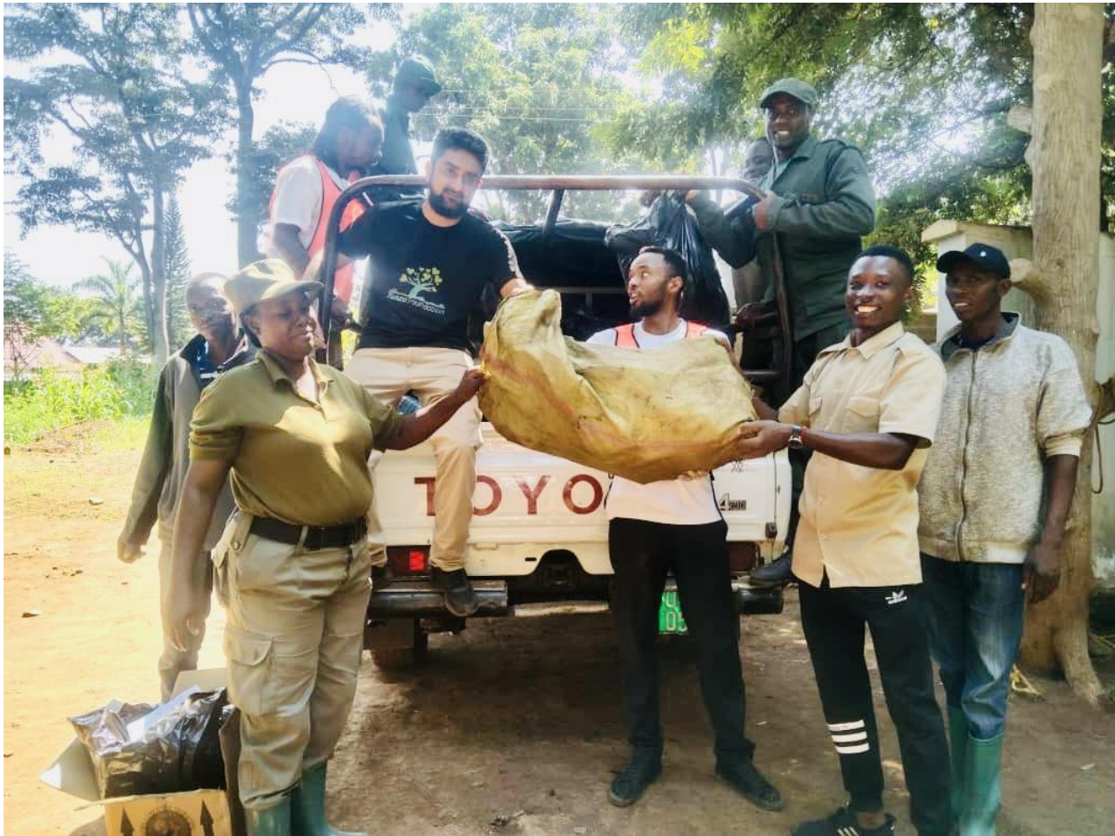
[Togetherness in eliminating Plastic Pollution ]

Togetherness in Eliminating Plastic Pollution. The TFS and Tunza Foundation members actively participated in the event, demonstrating their commitment to environmental conservation. The clean-up drive at Rau Forest Reserve on World Environment Day was a resounding success, with a significant amount of trash removed from the area. We extend our gratitude to the TFS for their support and to the Tunza Foundation members who participated in the event. This initiative highlights the importance of collective action in protecting our environment and its inhabitants.