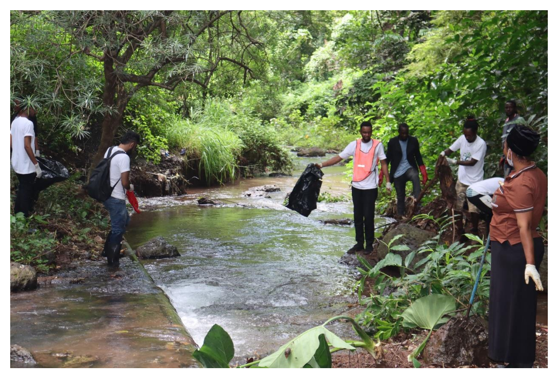
[Picking trash, liters and wastes that were thrown into the Coffee Curing River Spring]