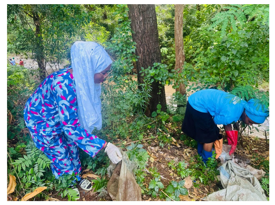
[Picking trash, litters and wastes around the Rau River]