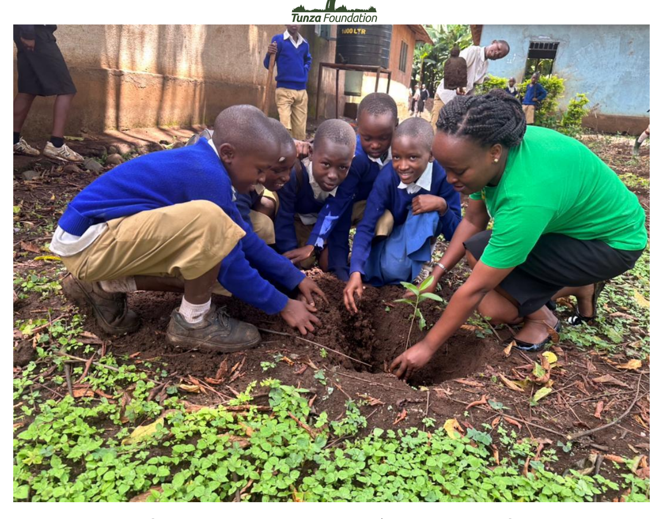
[Trees planting at Kisowoni and Kindi | Kati Primary schools]