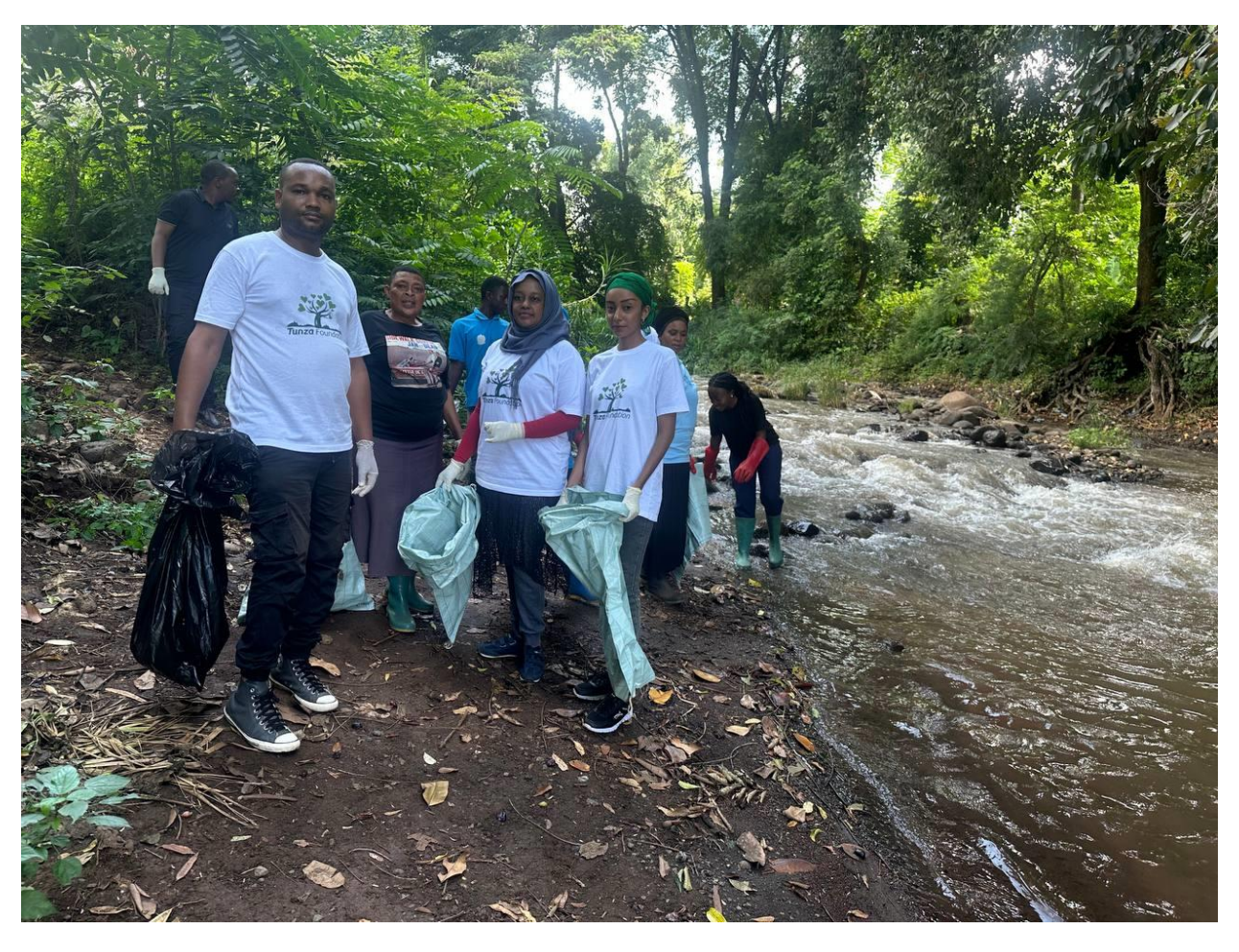
[Picking trash, liters and wastes that were thrown into the Rau River]