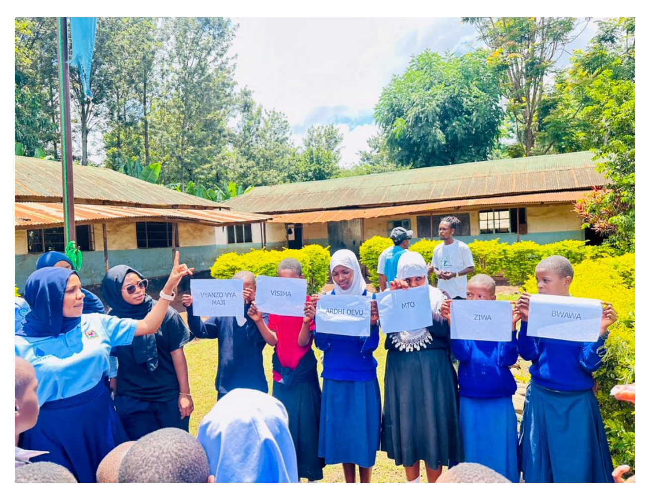
[Environmental lecture at the Kisowoni and Kindi Kati Primary schools]