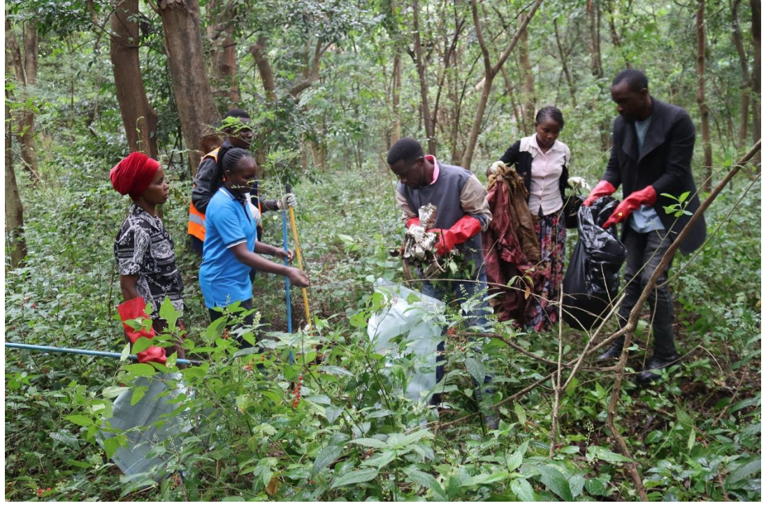
[Picking trash, litters and wastes around the Coffee Curing Spring]